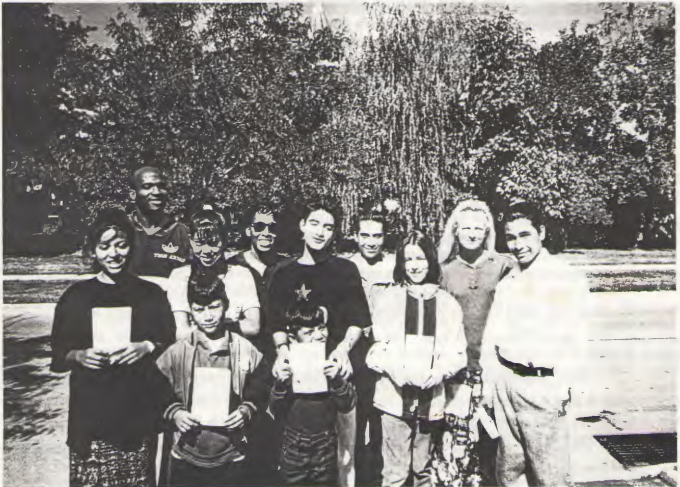
A Toronto youth canvassing group