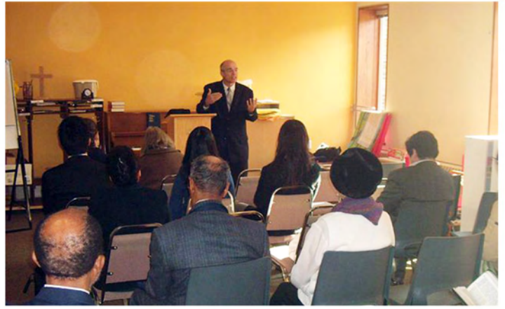
New Sabbath School In Scarborough, Canada