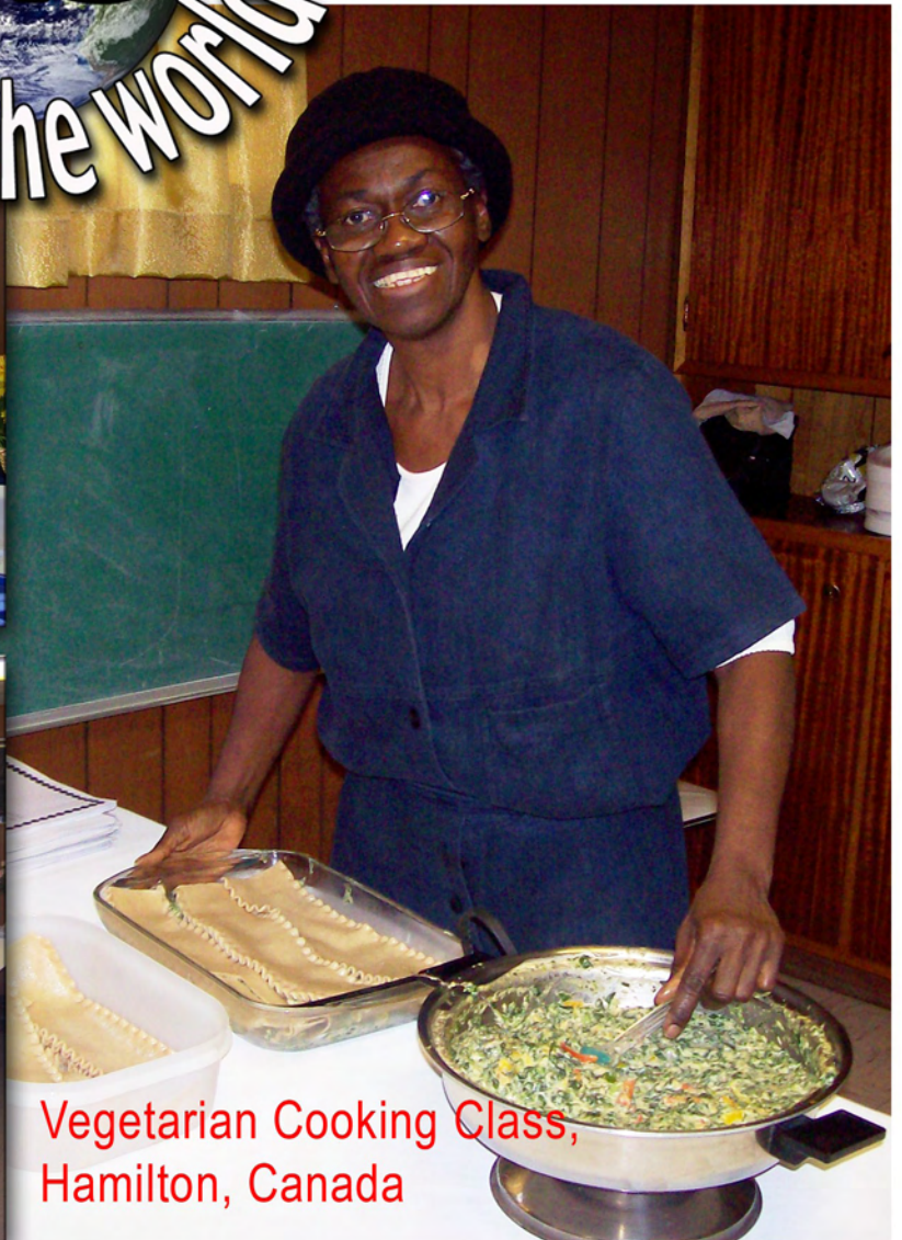
Vegetarian Cooking Class, Hamilton, Canada