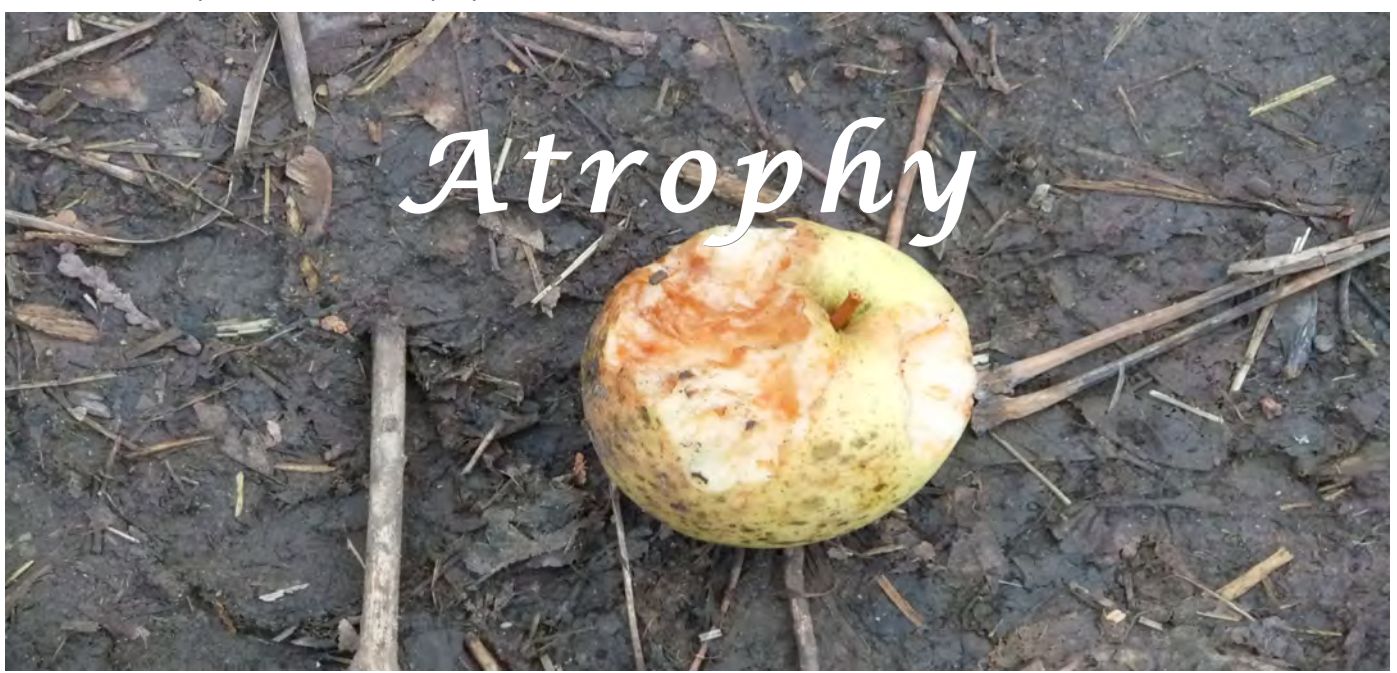
"And thou hast filled me with wrinkles, which is a witness against me: and my leanness rising up in me beareth a witness to my face." Job 16:8

"My bone cleaveth to my skin and to my flesh, and I am escaped with the skin of my teeth." Job 19:20