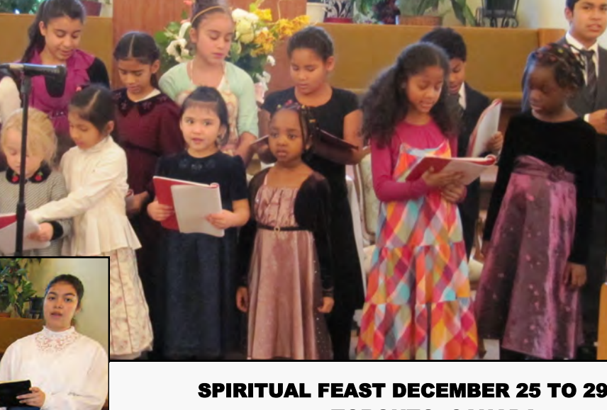
SPIRITUAL FEAST DECEMBER 25 TO 29, 2013 TORONTO, CANADA